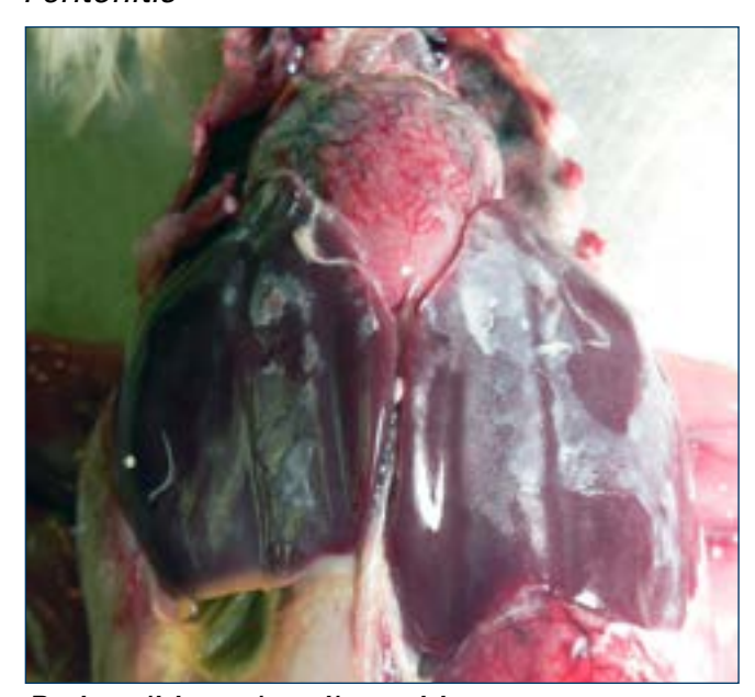
Pericarditis and perihepatitis